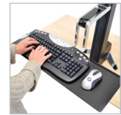
Large Keyboard Tray for WorkFit-S 97-653 (black)