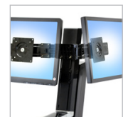
Hinged Bow for WorkFit-S 97-583-009 (black)