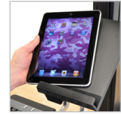
Tablet/Document Holder for WorkFit-S 97-558-200 (black) Includes lift handle