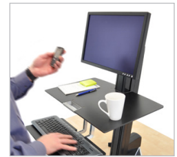
Worksurface for WorkFit-S 97-581-019 (black)

This kit converts a WorkFit-S, WorkFit-C or WorkFit-A Dual Workstation into a WorkFit LCD & Laptop Workstation